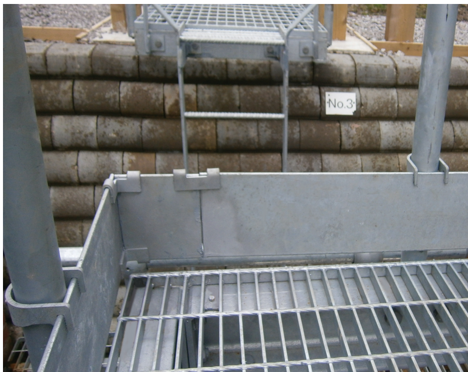
KG Connector - Patent Pending

Straight connectors and internal and external corners are all used to make up a complete continuous system, that is both robust, compliant and easy to fit.